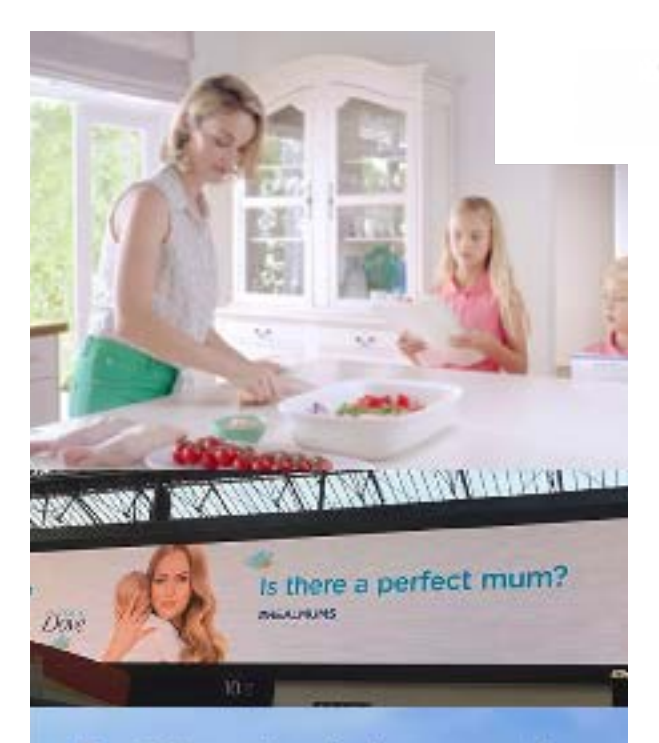
Put time back in your day.